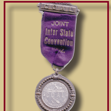
Worn by Chris Evans!