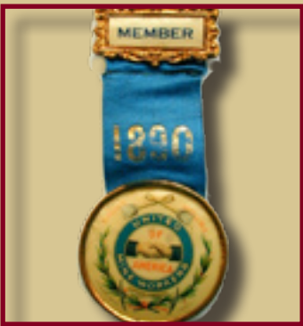
UMW Ribbon 1890