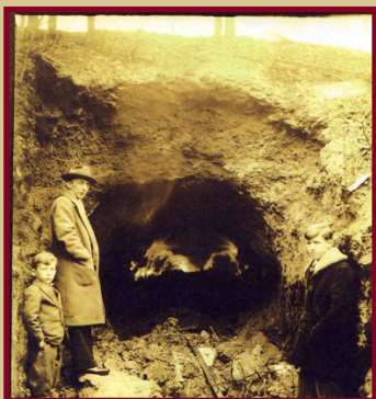
Ernie Pyle at Devils Oven